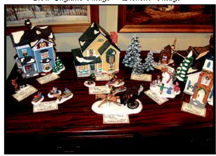
Snow Village — Christmas in the City