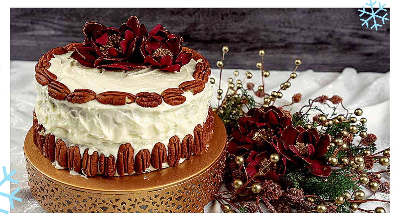
1/4 cup heavy whipping cream5 cups powdered sugar1 package pecans (optional)

1 package (8 ounces) cream cheese, softened