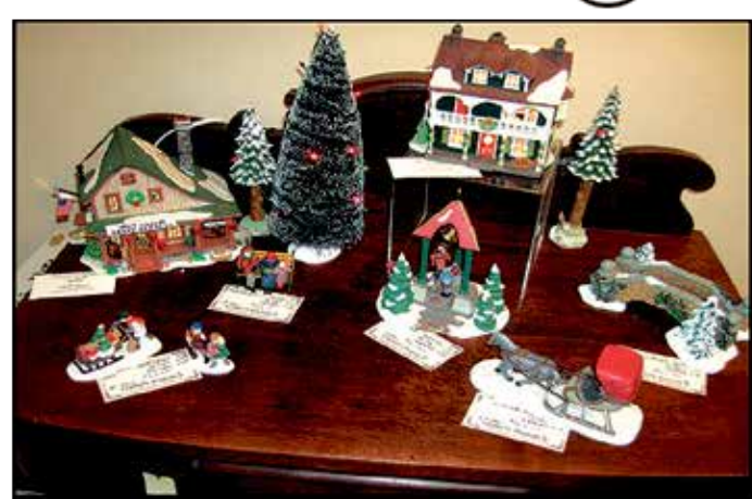
New England Village — Dickens' Village