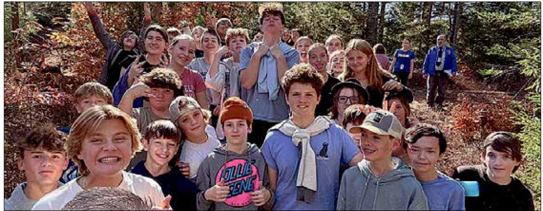
KRMS 8th graders participated in their annual Forestry Field Trip.

We welcome you to join us at 10 AM Sunday mornings at the Hillsboro Methodist Church, 16 Henniker St., Hillsboro NH. Share in fellowship, sing in joy and hear about the love Jesus already has for you. Come as you are. Jesus loves you just as you are!