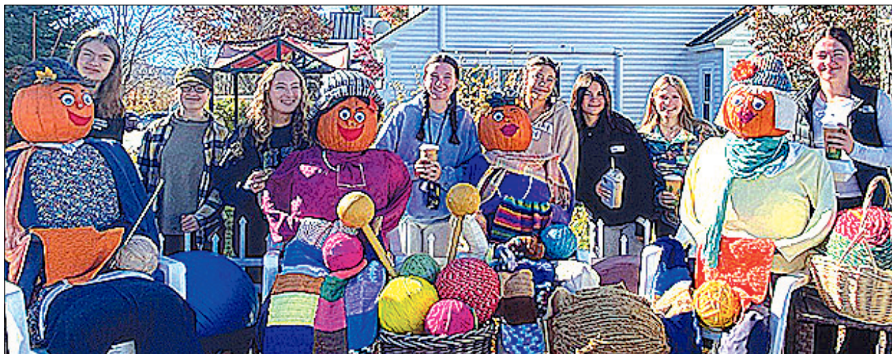
Eight KRHS students spent part of the day at Woodcrest Village on October 25 for their second session of the program that pairs students with residents to read and discuss literature, before moving into sharing their own personal stories.