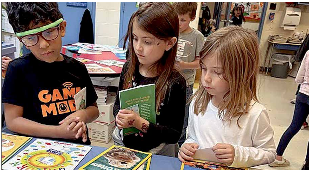
The Hillsboro Lions Club sponsored another Reading IS Fundamental (RIF) Program distributing free books to students K-6.