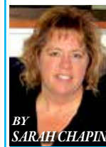
BY SARAH CHAPIN

Erectile dysfunction medications may increase risk of death when combined with common chest pain medication according to a new study published in the Journal of the American College of Cardiology . Phosphodiesterase type 5 inhibitors (PDE5i) sold under the names Viagra, Levitra, Cialis, and others — are a common medical treatment for erectile dysfunction (ED) in men with cardiovascular disease (CVD). The study suggests that patients are at higher risk for morbidity and mortality over time when PDE5is and nitrate medication are both prescribed. Erectile dysfunction is a common condition in middle-aged and older men and is a strong predictor of coronary artery disease. Nitrates are medications commonly used to treat angina, or chest pain. Both can cause drops in blood pressure, so they are contraindicated for use together.