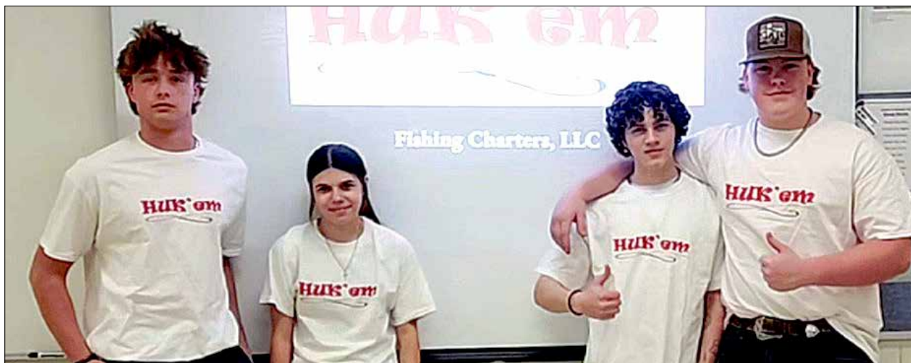
Four students are midway through the KRHS pilot of WorkReadyNH, a practical, professional skills-based course historically offered through our community colleges. The course is being taught at the high school by a community instructor and will culminate in students taking National Career Readiness Assessments, issued by ACT.