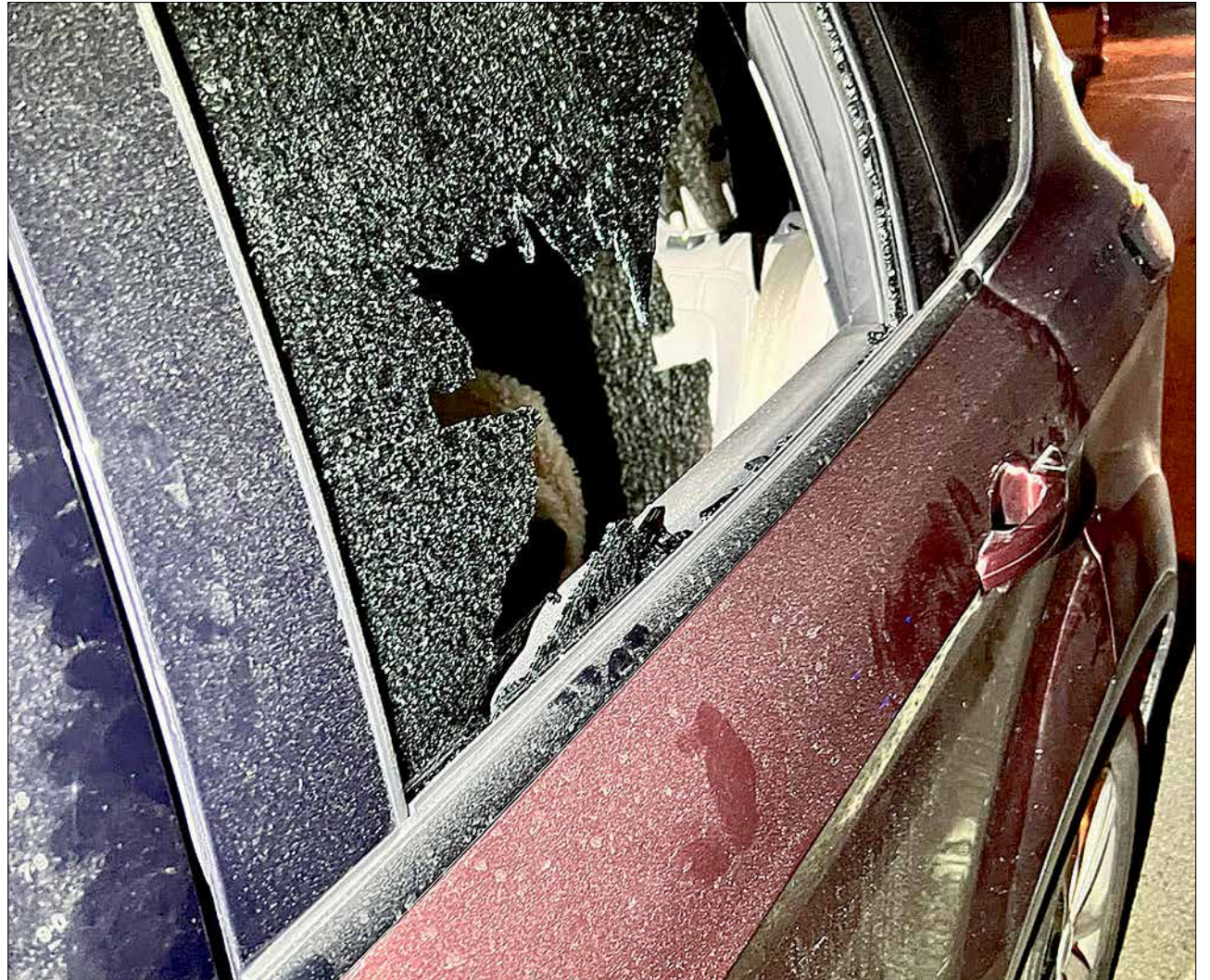
The Henniker Police Department is looking for any information regarding a road rage incident that took place on 10/29/24 around 7:00 p.m. The incident took place on Route 202/9 and continued onto Old Concord Road near Old West Hopkinton Road. The victim reported that he was passed on the left by an unknown white pickup truck (smaller, like a Ford Ranger). The driver of the pickup shot a firearm at the victim's car, resulting in the damage to both back passenger windows.

Your Weekly Newspaper Since 1869 A Tradition Worth Keeping