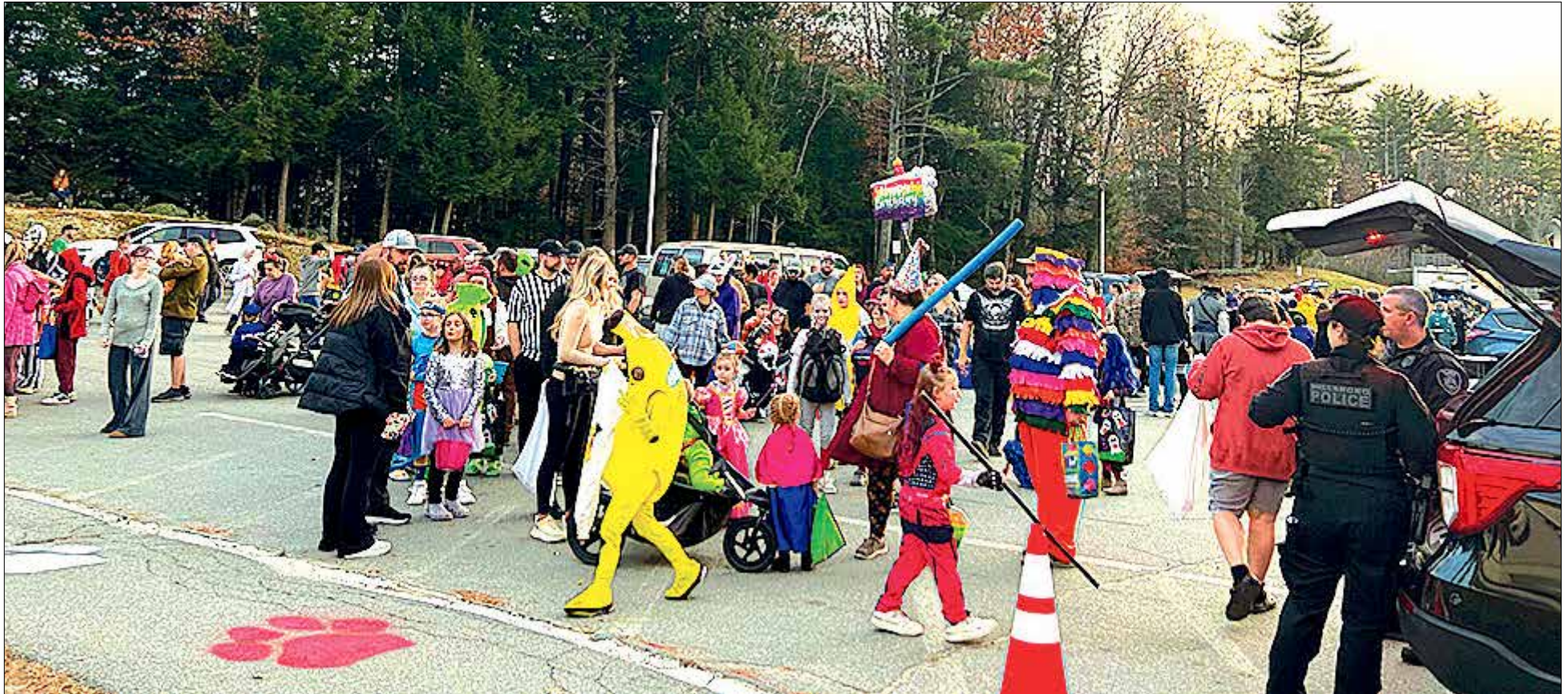
Hillsborough's Trunk Or Treat at the middle school drew its usual overflow crowd.