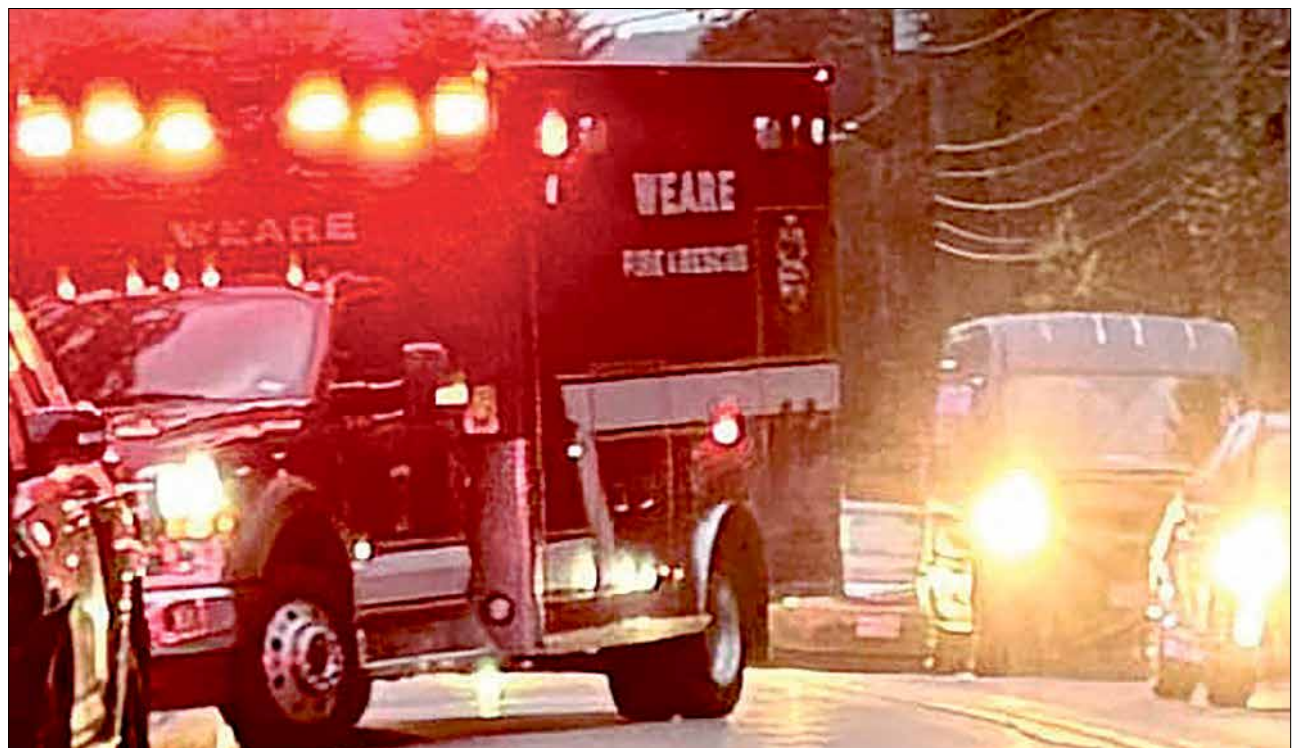
Multiple vehicle collision on S. Stark Highway. Do you know why the lane gets closed? It's not for entertainment purposes. It provides a safe working area, enabling police and rescue to attend to injuries and hazards.