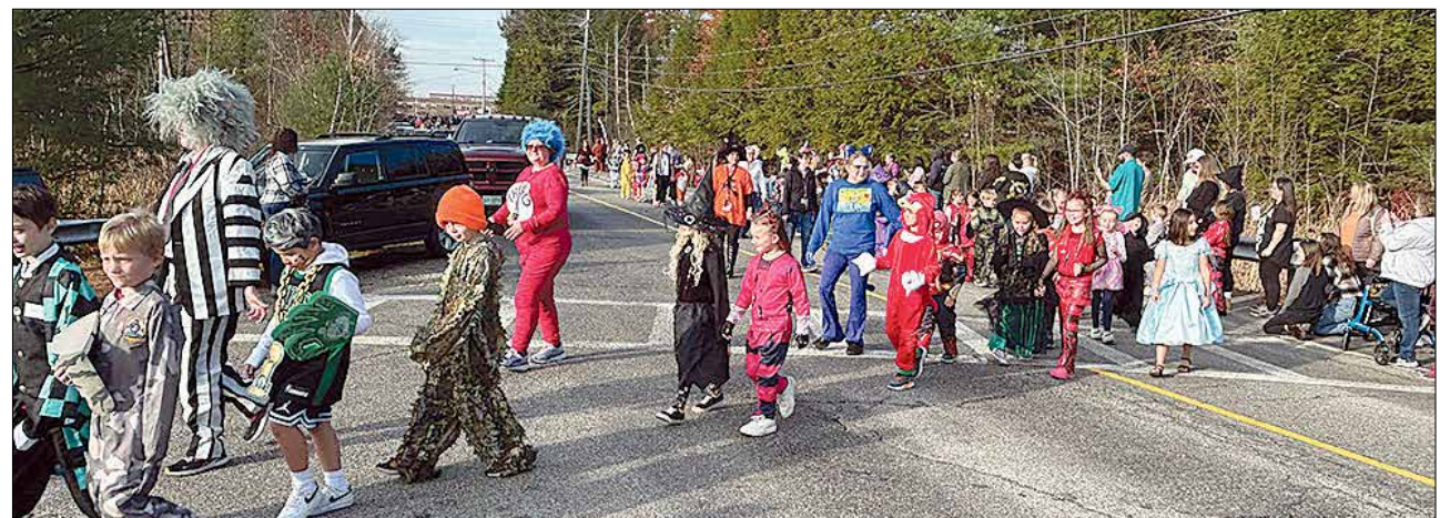
Hillsboro-Deering Elementary School's Halloween Parade.

Because while we are enjoying the freedom that they guarantee, we still miss them. And we wish they could be back with us today, this Veterans' Day.