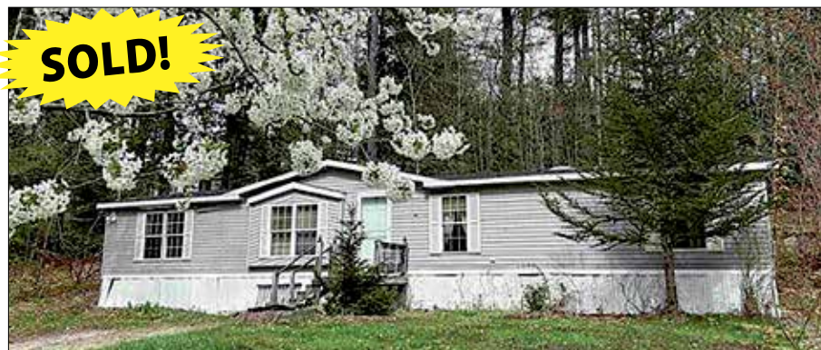
HILLSBORO: 19 Huntington Drive. ELVD, 4 beaches and playground for residents. Near Fox Forest for hiking, near snow mobile trails. $229,000

Thanks for a wonderful 2024 and looking forward to a better 2025!