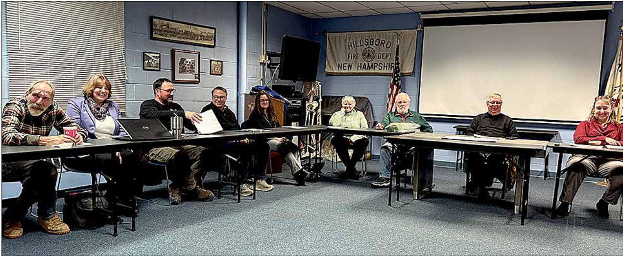
Members of the Hillsborough Select Board, Planning Board, Water & Sewer Commission and Economic Development Committee met in joint session to present their proposal for a Tax Increment Finance (TIF) District.