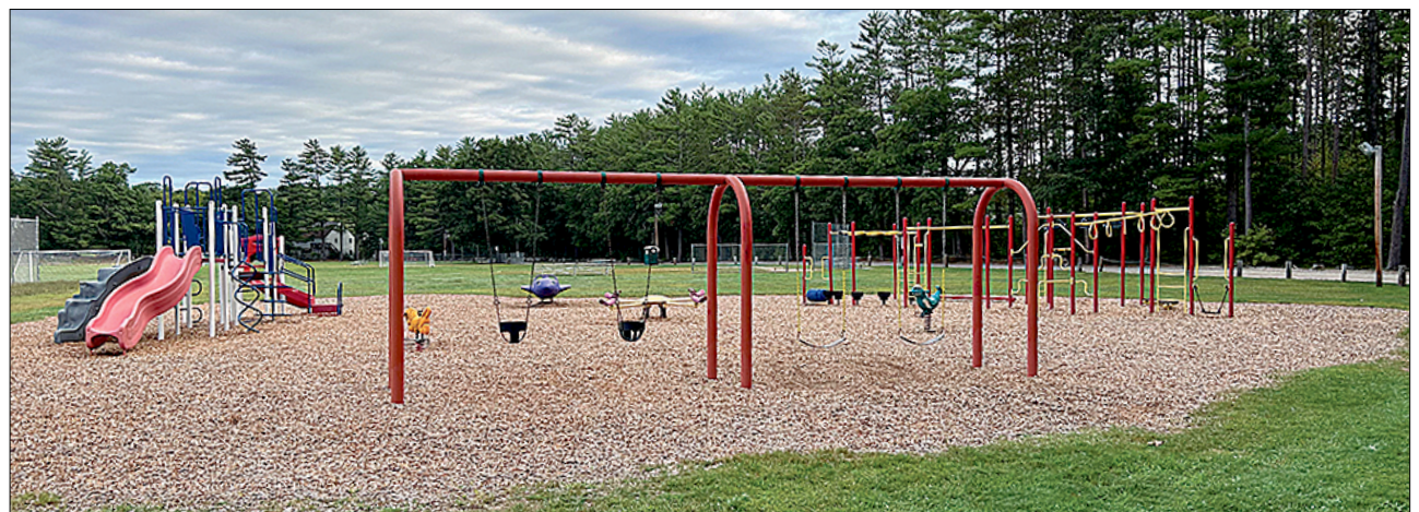
Grimes Field Playground.

Any and all efforts to improve the town are welcome and to be encouraged, but can't we do it without insulting our heritage?