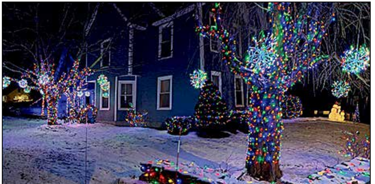
Largest Holiday Scene Winner & Viewers Choice Winner: 122 Maple Street.