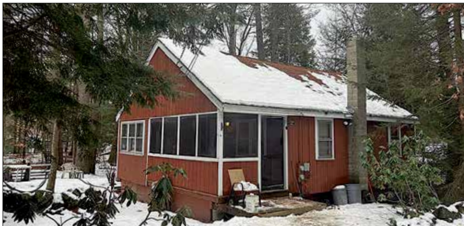
HILLSBORO: 14 Melody Lane. Two bedroom chalet style home on 3 lots. Residents have access to 4 beaches and playground. $229,900