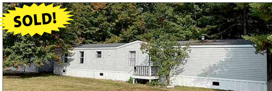
DEERING: 30 Johnson Road. Three bedroom mobile home on large lot in a Coop park. Detached garage. Near Rte. 202 between Hillsboro and Antrim. $69,900.