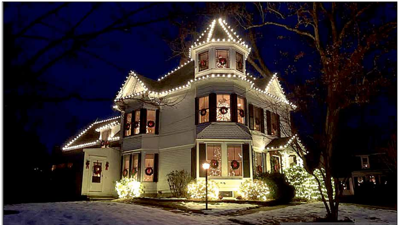
Most Traditional Display Winner: 161 Maple Street.