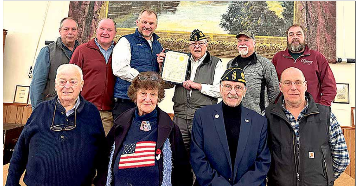
Members of Henniker's Board of Selectmen read a proclamation designating the Town of Henniker as a Purple Heart Community and presented it to members of Henniker's American Legion Post 78.

ed and valued. This can lead to increased community involvement and support for veteran-related initiatives[1].