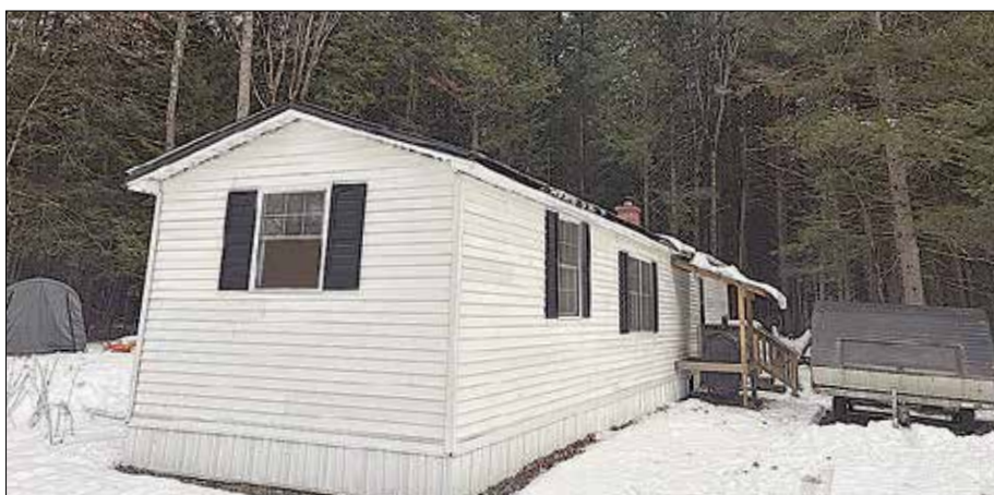
DEERING: 45 Keyes Farm Road. Recently renovated mobile on a dead end road in a Coop park. Near trails. $129,900