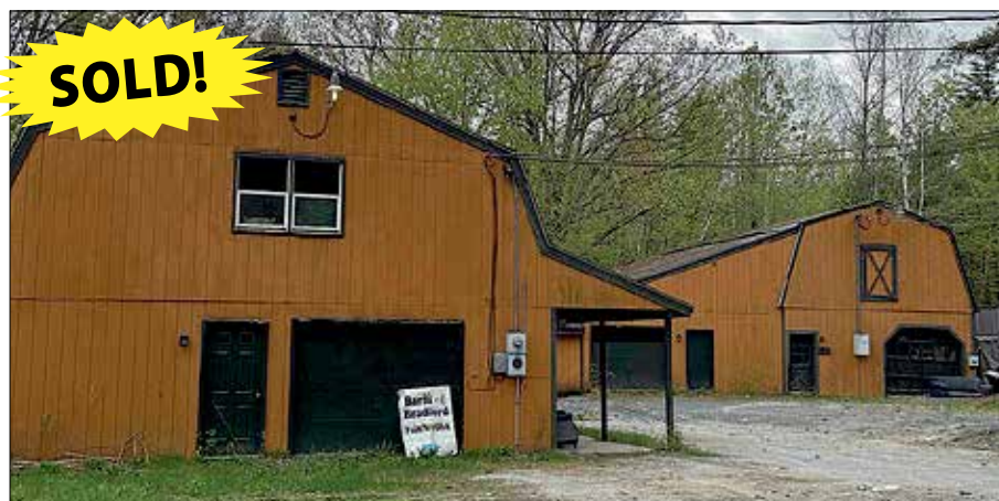
BRADFORD: 2951 State Route 114. Commercial building with over 11 acres. Near Lake Massasecum and beach area. Less than 20 minutes from Lake Sunapee/Sunapee Ski Area. $349,000