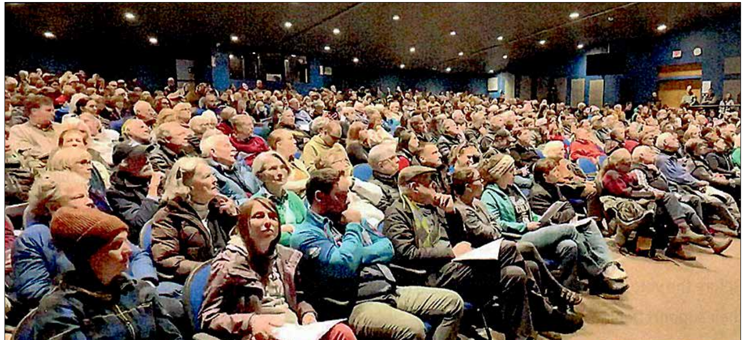
A record 1,556 attendees spilled over from the gym to the cafeteria, auditorium and library.

Avalanche buries buses in Kashmir, India