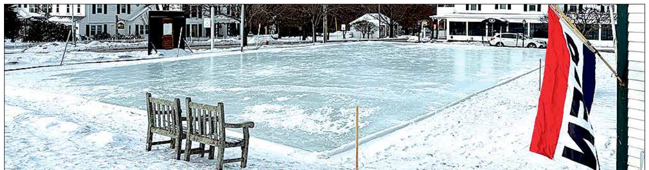
New London's skating rink is now open.