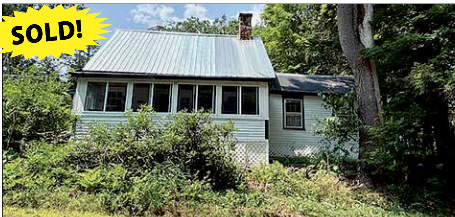
WINDSOR: 64 Black Pond Road. Two bedroom home in low tax Windsor. Detached garage/workshop. Also, detached woodshed. Nice backyard. $149,900