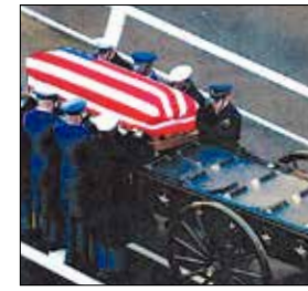
The flag-draped casket of former President Jimmy Carter is transferred to a horse-drawn caisson at the U.S. Navy Memorial before traveling on to the Capitol in Washington, Tuesday, January 7, 2025, where Carter will lie in state.

WASHINGTON FISHING DERBY: Camp Morgan Lodge opens at 5:00 for breakfast. Tickets $6- $15.