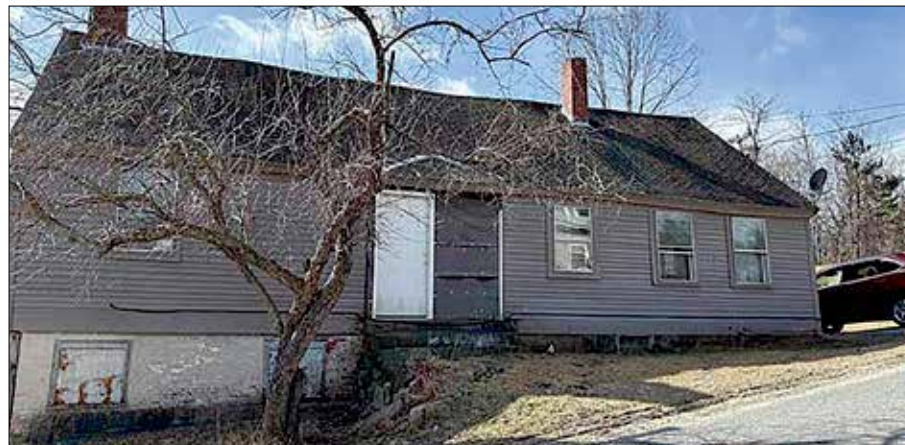
ANTRIM: 23 Depot Street. A work in progress on a town lot with town water and sewer. Abuts brook. Near town center. $165,000