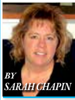
BY SARAH CHAPIN

According to a new study published in Molecular Bio-medicine , Metformin and AGIs show potential for improved outcomes in COVID-19 patients with type 2 diabetes. These medications reduced all-cause mortality in COVID-19. Conversely, insulin use was linked to an increased risk of death. Alpha-glucosidase inhibitors (AGIs) include Acarbose (Glucobay, Precose), the most commonly prescribed AGI; and Miglitol (Glyset), another FDA-approved AGI.