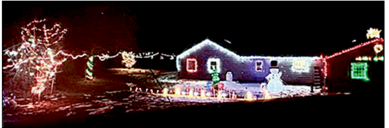
Best Overall Theme Winner: 58 Old West Hopkinton Road.