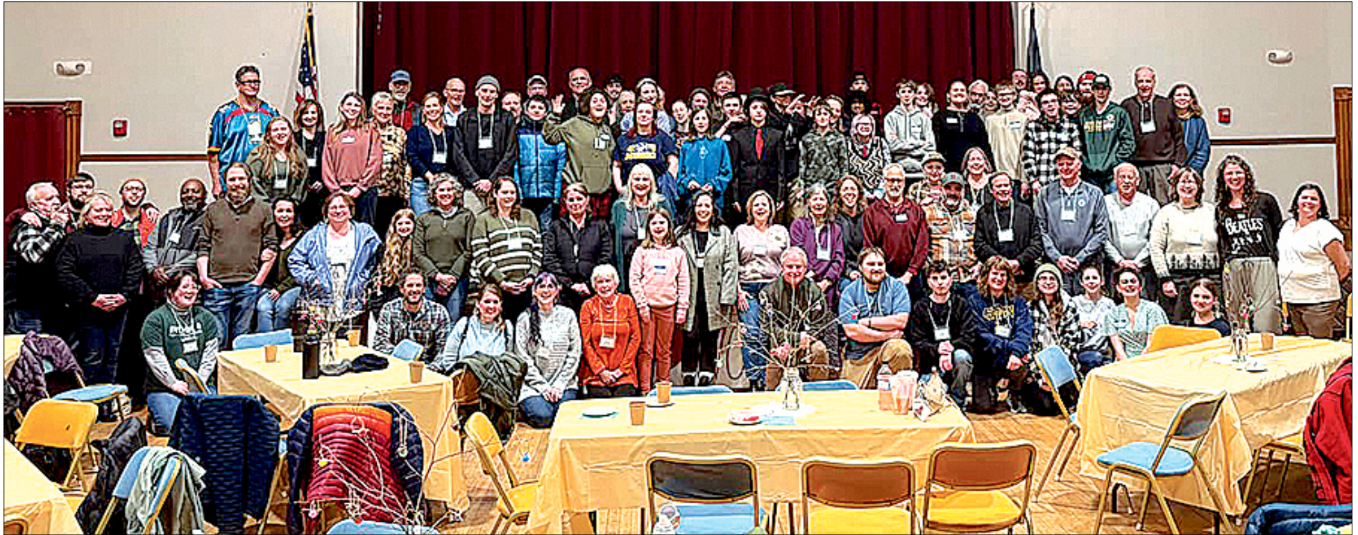
More than 100 volunteers, teens, and families showed up for The Grapevine's Volunteer Celebration at the Antrim Town Hall last week. The Grapevine celebrated the amazing volunteers who make The Grapevine and Avenue A's programs possible.