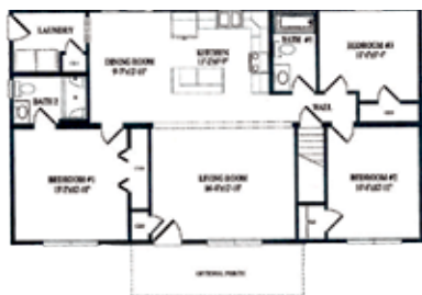
4 Cardinal Circle Hillsborough Brook Stone: 1,320 Sq. Ft 3 bedroom, 2 bath Ranch $347,000