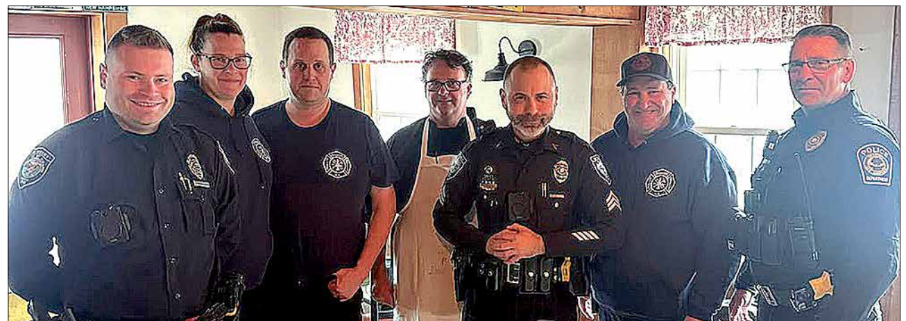
Bradford NH Fire Rescue, Bradford NH Police Department and Newbury PD helped deliver Easter meals to Bradford and Newbury residents. This wouldn't have been possible without the generosity of Team Applesseed.

“Creative Solutions” award in recognition of their Community Wood Bank program.