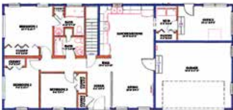
2 Cardinal Circle Hillsborough Summer Brook: 3 Bedroom, 2 Bath Ranch with Den/ Office & 2 Car Garage $399,500