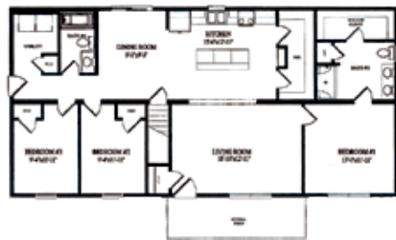
8 Cardinal Circle Hillsborough Middle Brook: 1,540 Sq. Ft. 3 Bedroom, 2 Bath Ranch $426,000