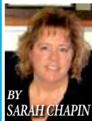
BY SARAH CHAPIN

Ibuprofen (Advil, Motrin) and paracetamol (Acetaminophen, TYLENOL) are common over-the-counter medications that many of us reach for when we're sick. But a new study published in npj Antimicrobials and Resistance shows that these trusted staples are quietly fueling one of the world's biggest health threats: antibiotic resistance. The researchers found that ibuprofen and paracetamol are not only driving antibiotic resistance when used individually but amplifying it when used together. Ibuprofen and paracetamol significantly increased bacterial mutations, making E. coli highly resistant to the antibiotic ciprofloxacin.