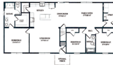
7 Cardinal Circle Hillsborough Spring Brook: 1,650 Sq. Ft. 3 bedroom, 2 bath Ranch $366,000