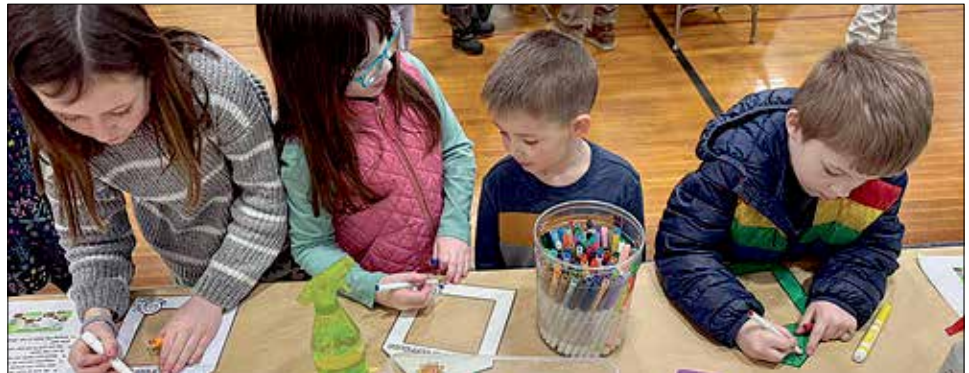
Thanks go out to the Dunbarton Garden Club and the Dunbarton Elementary School PTO for funding the ROOTS Club activity at this morning's Easter Bunny Breakfast. With the help of some experienced ROOTS Club members, many happy children created window "greenhouses." We are sure beans will be growing in windows all across Dunbarton!