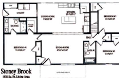
3 Cardinal Circle Hillsborough Stoney Brook: 1,450 Sq. Ft. 3 Bedroom, 2 Bath Ranch $354,000