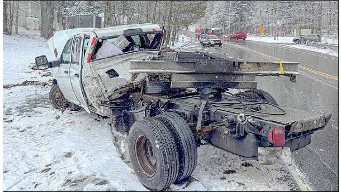
Pictured above is the disabled vehicle from the scene of the crash.