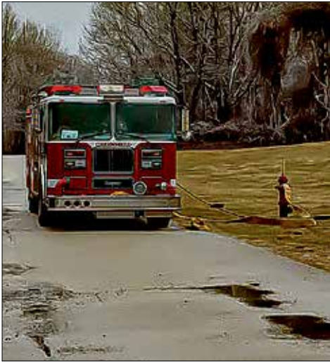
The Greenfield, NH Volunteer Fire Department was dispatched to 111 South View Rd. for a reported LP tank leaking. A Peterborough Fire & Rescue was requested to assist. The incident was overall minor in nature, no readings inside the building and Rymes Tech responded to seal the tank up.

Sunapee Fire & EMS and Sunapee Police cleared the scene at 11:51 a.m. once the vehicle was towed away and the roadway was reopened.