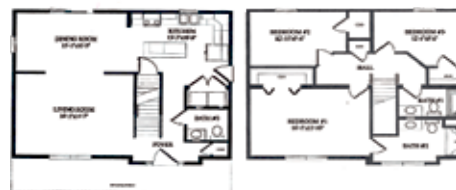
5 Cardinal Circle Hillsborough Fair Haven: 1,610 Sq. Ft. 3 bedroom, 2.5 bath Two-Story $371,000