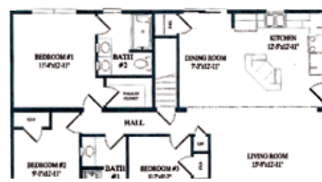
9 Cardinal Circle Hillsborough Rolling Brook: 1,210 Sq. Ft. 3 Bedroom, 2 Bath Ranch $347,000