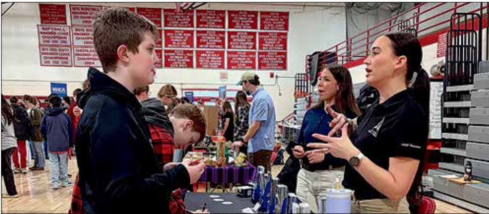
H-D Middle School 7th graders got a visit last week from the UNH STEM Mobile to learn about biofabrication. Students in 7th and 8th grade visited the College and Career Fair at the high school.