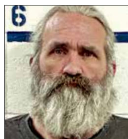
of Aggravated Felonious Sexual Assault