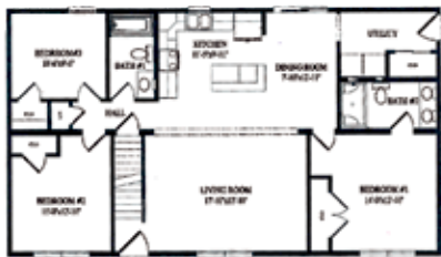
6 Cardinal Circle Hillsborough New Haven: 1320 Sq. Ft. 3 Bedroom, 2 Bath cape with unfinished 2nd floor $362,000