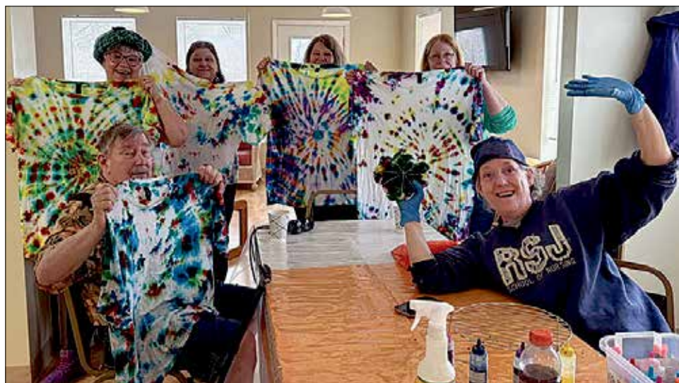
The Antrim-Bennington Lions Club hosted a 'Tie Dye' crafting activity with residents of Antrim Village. Creative fun was had by everyone who participated.